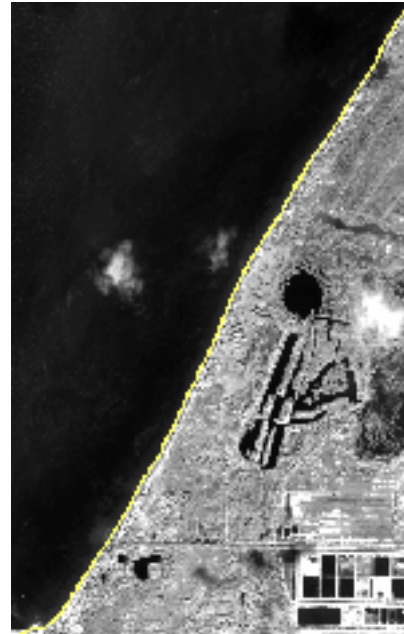
Figure 3. 3-D Shoreline in Tampa Bay

To provide a good understanding of spatial data integration and uncertainty analysis, a 3D uncertainty visualization system (Figure 2) was developed using Java3D techniques. The 3D relationship between satellite altimetric data, water-gauge data, the hydrodynamic model, and high-resolution DEM can be analyzed visually.